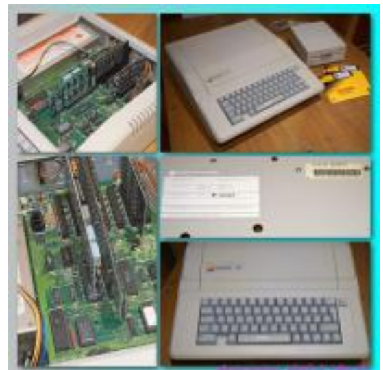
Platinum Apple II/e (Hybrid) A2S2080P / A2S2080B model for the United Kingdom