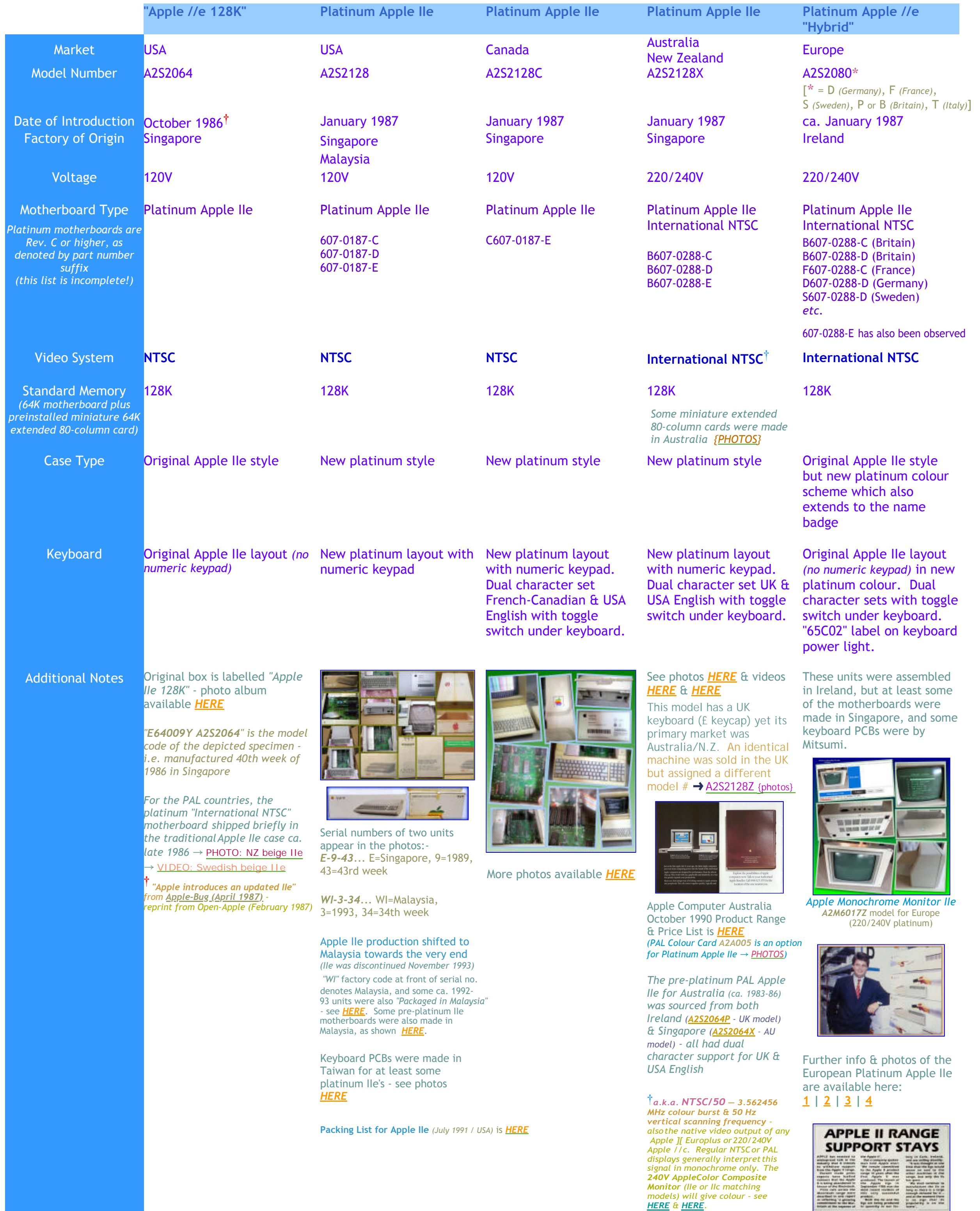
Table comparing known variants of the Platinum Apple IIe

Others ?? A Spanish version of Platinum Apple IIe was evidently released in Latin America - here's a photo by Jose Ricci - a model code "A2S2128E" would be most likely but this is just an educated guess. A beige Apple II/e with Western Spanish keyboard also exists model A2S2064E - 115V NTSC . This model appears related to the Canadian beige Apple II/e ( model A2S2064C ) - affixed to their undersides is a common model ID sticker for units assembled in Ireland. The Apple II/e was also locally manufactured by Apple de Mexico in Nancipalpan . In Europe, the PAL Spanish/Portuguese Apple II/e utilizes a somewhat different layout.